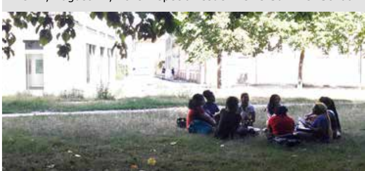
In front of the seminar building

Berlin, August 12, 2019 - special issue: RUEG Summer School