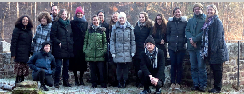
RUEG on top - of Burg Diemerstein

Berlin, Kaiserslautern, around St. Nicholas Day, 2019