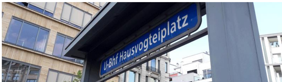
RUEG metro station in Berlin, near Humboldt-University

Gather.town will be used for the poster session and the final plenary concluding the conference. You can access Zoom via Gather.town or via Zoom directly. More detailed instructions on Zoom and Gather.town can be found on the conference website: https://www.linguistik.hu-berlin.de/en/rueg/conference2021