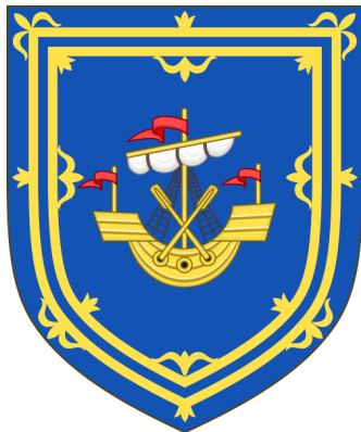
Figure: Arms of the Feudal Earldom of Orkney, by Sodacan (Wikimedia Commons, CC-BY-SA 4.0)